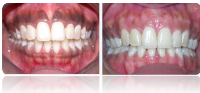
Figure 2. Laser depigmentation.