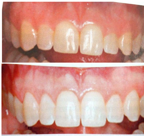
Figure 3. Crown lengthening before Laser therapy. After Laser therapy.