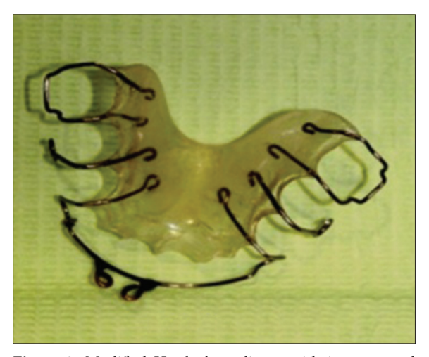
Figure 2: Modified Hawley's appliance with incorporated loops in labial bow to engage 3/16" elastics.

An 8-year-old Indian boy appeared at our private practice 3 months ago with the chief complaint of an unerupted upper left central incisor. According to reports, the youngster was 4 years old when he suffered an injury to his upper primary incisors (luxation injury on anamnesis of his parents) and was treated for pulp necrosis in another location. Clinical examination revealed Grade 3 mobility in the primary maxillary laterals, with the maxillary left central (21) ectopically erupting in the vestibular sulcus. Further inspection revealed that the growing centrals had adequate space for teeth eruption with the permanent molars in Class I occlusion. It was planned to intervene with a modified removable Hawley's appliance with a labial bow incorporating hooks and elastics attached to Begg's bracket bonded to 21 [Figure 1] after informed consent and discussion with parents. To avoid future issues, alignment and extrusion of 21 was planned orthodontically. There was clinically substantial extrusion of 21 and alignment into the arch after 6 weeks of compliant use by the individual [Figure 2].