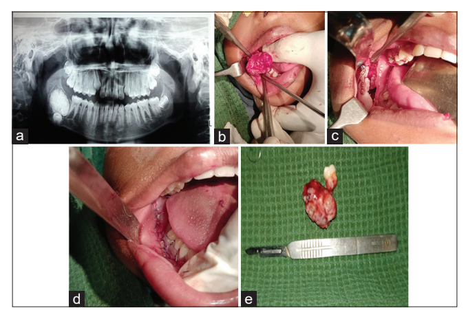
Figure 2: (a) Pre-operative OPG, (b) excised odontome, (c) reduction of surgical site, (d) wound closure with 3-0 Vicryl, and (e) surgically excised odontome.

treatment option if it is of aggressive or malignant type. Furthermore, conservative management can be opted in case of benign tumors like odontome.