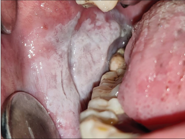
Figure 1: White patch on the right buccal mucosa along the occlusal plane.

ratio. These dysplastic features were evident in the lower two-thirds of the thickness of the epithelium. The underlying connective tissue was loose and fibrillar with blood vessels and inflammatory cells suggestive of moderate epithelial dysplasia that were compatible with clinical features of leukoplakia as shown in Figure 2. Another finding was the presence of multiple glandular structures in the connective tissue adjacent to the overlying epithelium. The morphology of cells and arrangement were consistent of sebaceous glands which is shown in Figure 3.