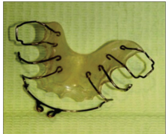
Figure 2: Modified Hawley's appliance with incorporated loops in labial bow to engage 3/16" elastics.

An 8-year-old Indian boy appeared at our private practice 3 months ago with the chief complaint of an unerupted upper left central incisor. According to reports, the youngster was 4 years old when he suffered an injury to his upper primary incisors (luxation injury on anamnesis of his parents) and was treated for pulp necrosis in another location. Clinical examination revealed Grade 3 mobility in the primary maxillary laterals, with the maxillary left central (21) ectopically erupting in the vestibular sulcus. Further inspection revealed that the growing centrals had adequate space for teeth eruption with the permanent molars in Class I occlusion. It was planned to intervene with a modified removable Hawley's appliance with a labial bow incorporating hooks and elastics attached to Begg's bracket bonded to 21 [Figure 1] after informed consent and discussion with parents. To avoid future issues, alignment and extrusion of 21 was planned orthodontically. There was clinically substantial extrusion of 21 and alignment into the arch after 6 weeks of compliant use by the individual [Figure 2].