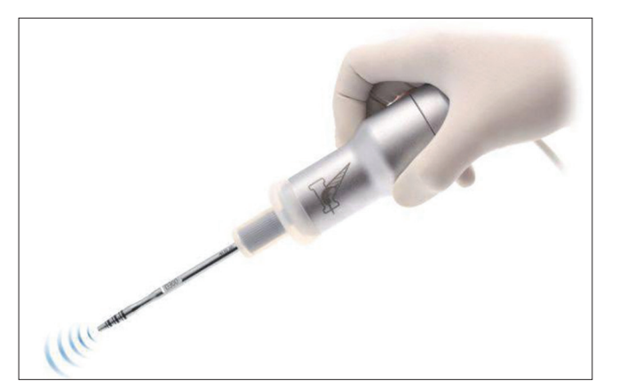
Figure 2: One handed operation of magnetic mallets.