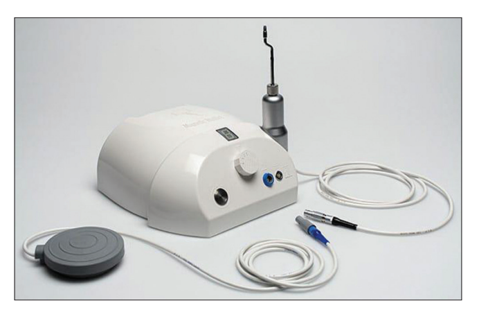
Figure 1: Magnetic mallet.

It is to be noted that the maximal force of traditional handpieces is 40 kp and the magnetic mallets provide up to 6–7-fold increased force compared to the traditional ones. Even though the magnitude of force applied with magnetic mallets is much greater than conventional osteotomes, it is less damaging to the patients. Hence, the magnetic mallets are far less invasive, due to the fact that the 350–400 \mu s occur with traditional mallets to give a fast blow whereas this duration for magnetic mallets is reduced to 1/4<sup>th</sup> or 1/5<sup>th</sup> of its time. The impulse of blow takes only 80–100 \mu s with the magnetic mallets. Therefore, in spite of a greater force being applied, the extremely short time of force application drastically reduces the discomfort to the patients.