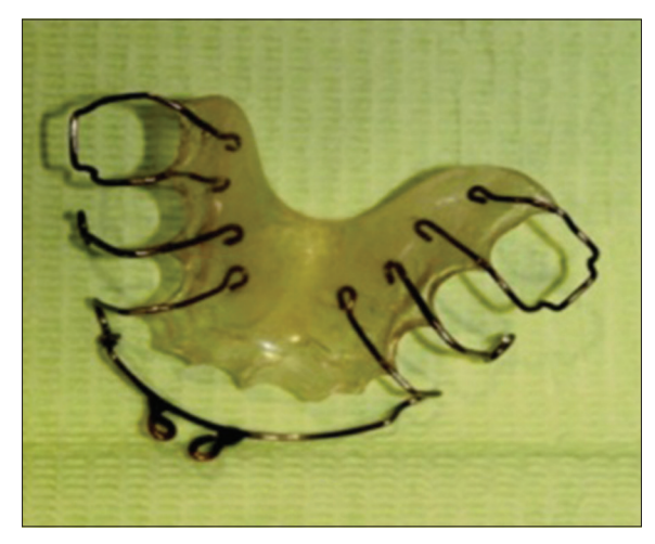
Figure 2: Modified Hawley's appliance with incorporated loops in labial bow to engage 3/16" elastics.

An 8-year-old Indian boy appeared at our private practice 3 months ago with the chief complaint of an unerupted upper left central incisor. According to reports, the youngster was 4 years old when he suffered an injury to his upper primary incisors (luxation injury on anamnesis of his parents) and was treated for pulp necrosis in another location. Clinical examination revealed Grade 3 mobility in the primary maxillary laterals, with the maxillary left central (21) ectopically erupting in the vestibular sulcus. Further inspection revealed that the growing centrals had adequate space for teeth eruption with the permanent molars in Class I occlusion. It was planned to intervene with a modified removable Hawley's appliance with a labial bow incorporating hooks and elastics attached to Begg's bracket bonded to 21 [Figure 1] after informed consent and discussion with parents. To avoid future issues, alignment and extrusion of 21 was planned orthodontically. There was clinically substantial extrusion of 21 and alignment into the arch after 6 weeks of compliant use by the individual [Figure 2].