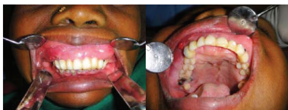
Figure 2. Intraoral examinations showing diffuse bony lesion on both the labial and palatal surface of maxillary jaw.